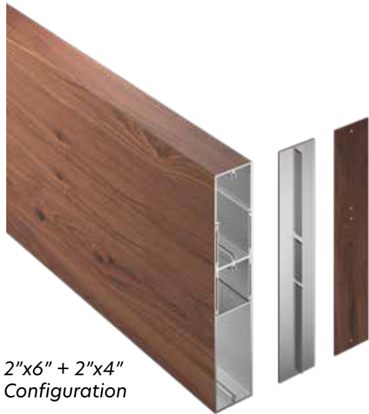
2"x6" + 2"x4" Configuration