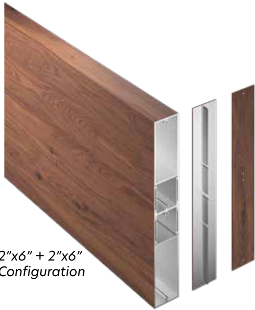
2"x6" + 2"x6" Configuration